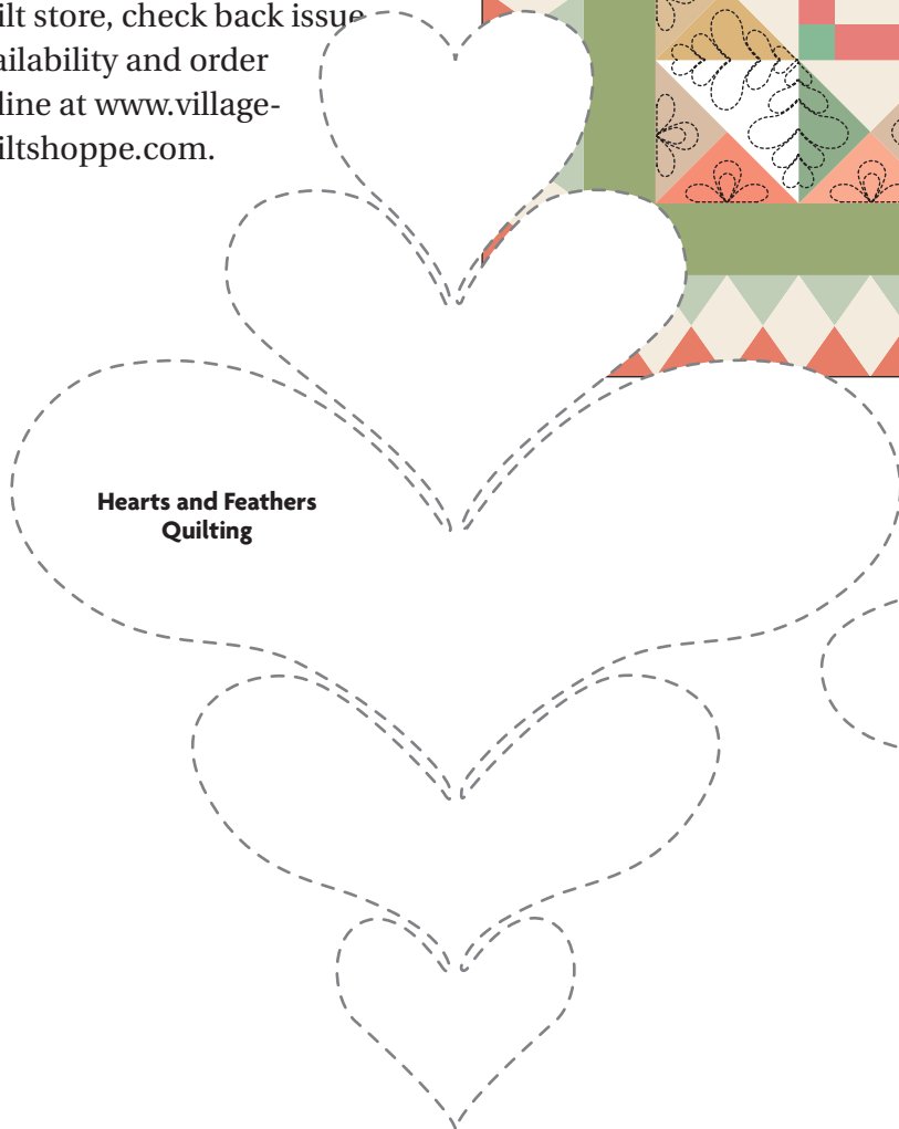
Hearts and Feathers Quilting